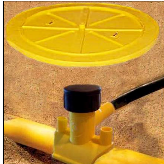
Pinpoint and Protect Your Buried Facilities

LOCATE SERVICE TEE'S WITHOUT RISKING DAMAGE TO BURIED FACILITIES The DISKMARK™ 3000 "The Best Way to Mark and Locate Service Tee's"