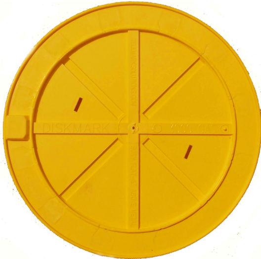
10 Inches Diameter 10 Feet Locating Range