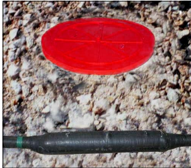
Pinpoint and Protect Your Buried Facilities

LOCATE SPLICES WITHOUT RISKING DAMAGE TO BURIED FACILITIES The DISKMARK™ 1000 “The Best Way to Mark and Re-Locate Buried Splices”