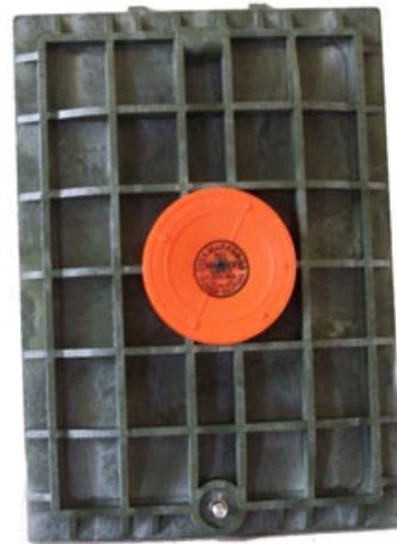
Pinpoint Buried Hand Holes

THE TELEMARK ELECTRONIC MARKER A Unique Product for Quick and Accurate Locating of Hand Holes, Vaults and Boxes.