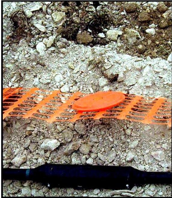
Marks Buried Closure