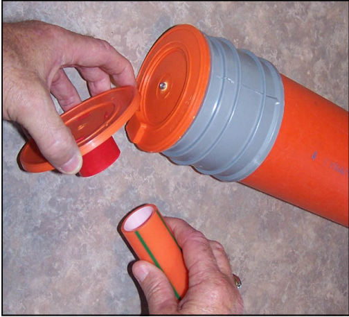
Combination 4”/ 2”