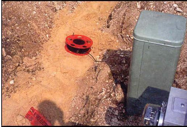
Pre-wired Locatable Service Drop