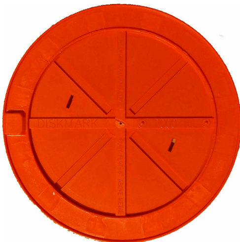
10 Inches Diameter 10 Feet Locating Range