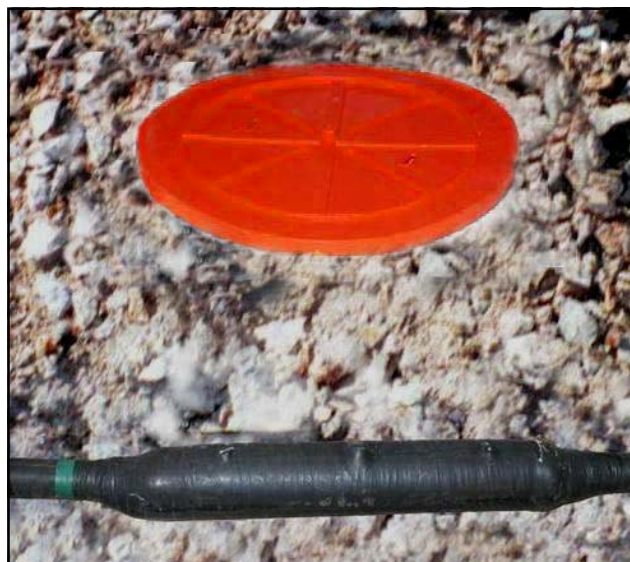
Pinpoint and Protect Your Buried Splices

LOCATE SPLICES WITHOUT RISKING DAMAGE TO BURIED FACILITIES The DISKMARK™ 2000 “The Best Way to Mark and Re-Locate Buried Plant”